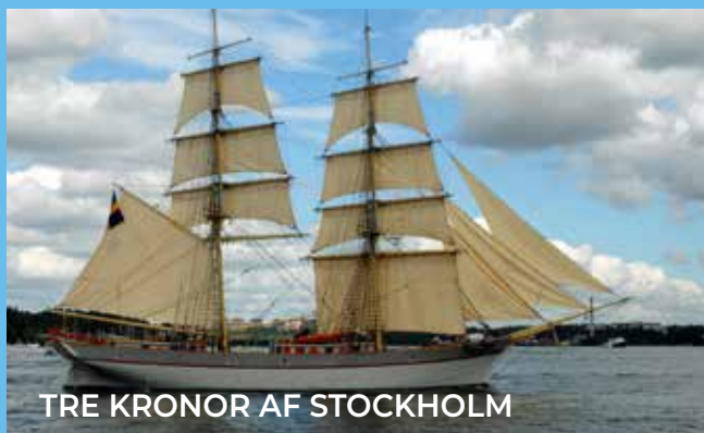
TRE KRONOR AF STOCKHOLM